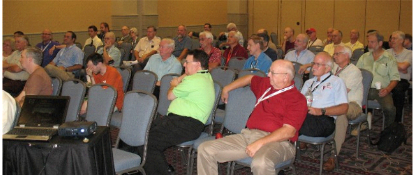
The meeting was well attended with over 45 members and guests.