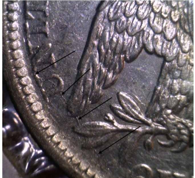
Figure 3. 1854 25¢ Thin Date, reverse die crack

that runs through the left arrow, the left edge of the rock, and nearly to star 1. Earlier die states have the portion of the illustrated crack between the rock and