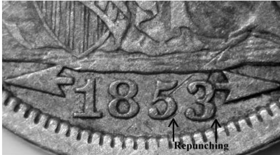
Medium Level Date - DR -1B0

For those readers who may have not explored the Seated dime varieties web-book, following are images from the F-107b terminal die state. There are traces of repunching at the right of the 53 digits while the reverse die cud is simply spectacular in the eyes of a passionate varieties collector.