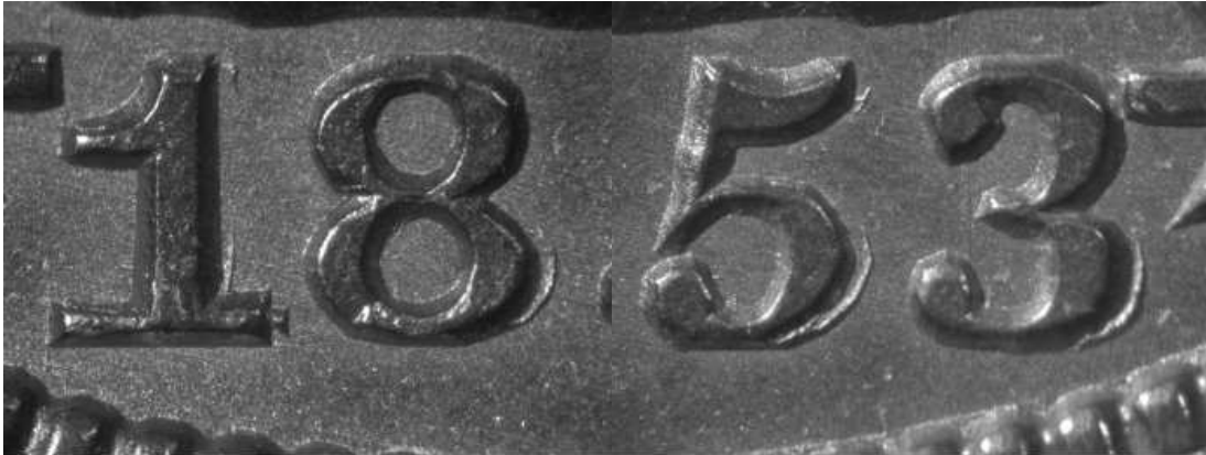
Repunching on 18 Digits

digit repunching. Until purchasing this dime, the 1 digit repunching has never been photographed with such clarity. Repunching is obvious at the bottom right of each digit but traces of repunching are revealed at the top right of the 1 and 5 digits. The second image of the right arrow highlights a die defect type pimple on the fresh obverse die which was unknown to me.