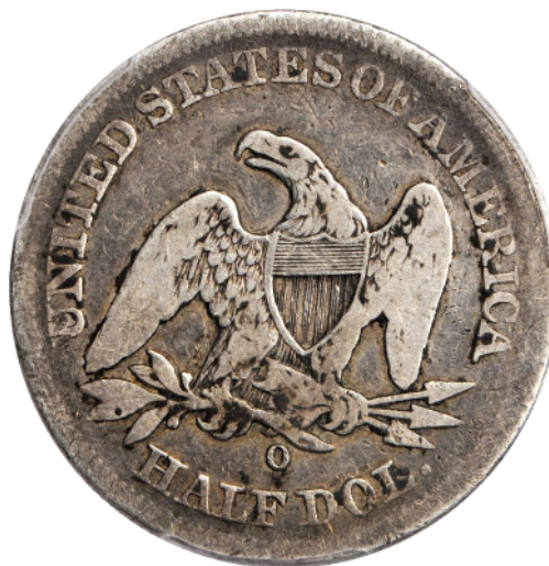
The 4th 1853-O NA half dollar - PCGS Secure VG8