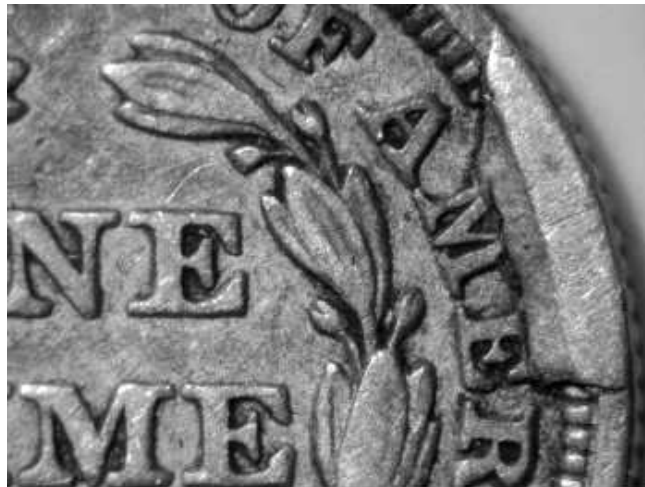
Die cud at 2:00 - 3:00