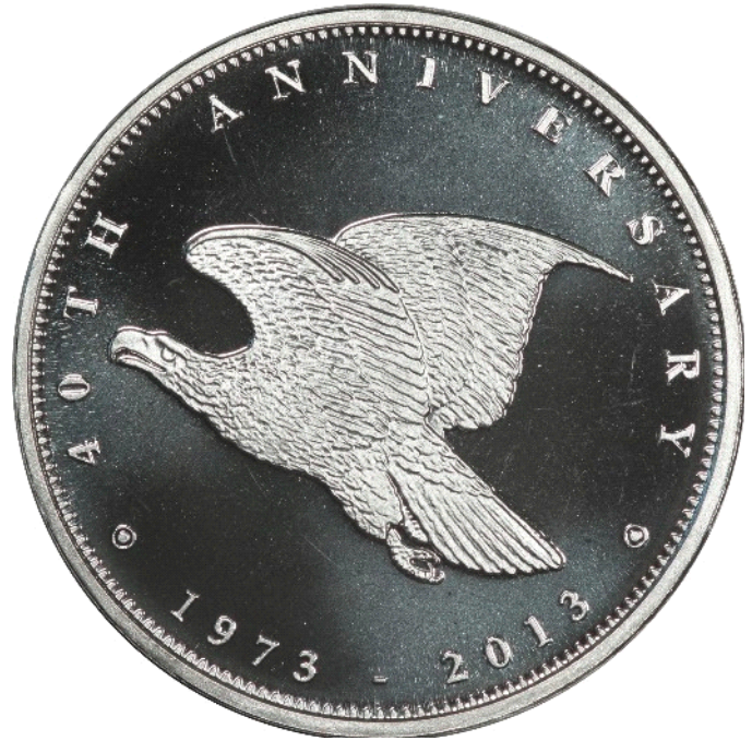
Photos of one of the two LSCC 40 th Anniversary medal Proof silver “Trial Strikes”

Club members had their first opportunity to handle the first strike copper and silver proof medals at the Philadelphia ANA Worlds Fair of Money. In short, they were a big hit. All the feedback we heard supported this program and the medal will be popular with the membership.