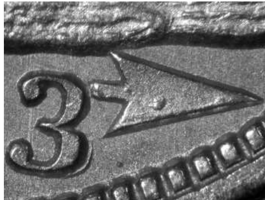
Die defect on right arrow

In the Liberty Seated dime varieties guidebook at www.seateddimevarieties.com , I had previously listed only two die states for the F-107 repunched date. The F-107 listing originally included the early and later die states with strong and eroded repunching on the date digits. The F-107a listing features a massive reverse cud which should be a separately listed die state. After purchasing the “first strike” variety example, it was decided to record three die states for the Top 100 Varieties F-107 listing. They are;