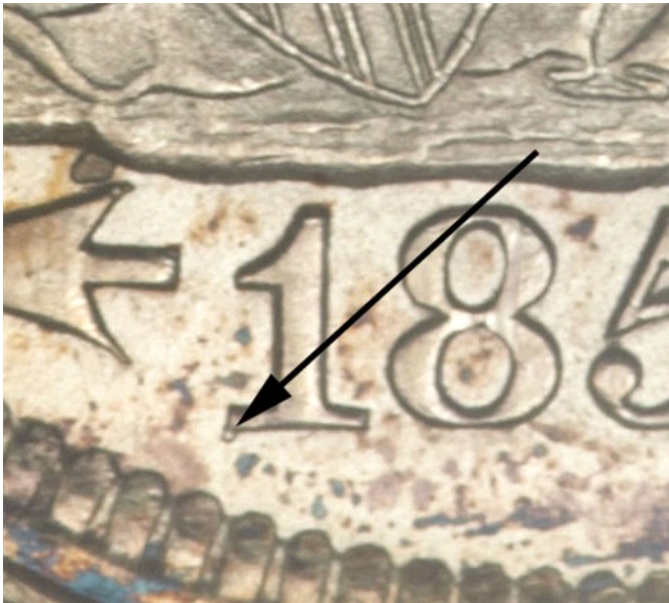
Figure 1. 1854 25¢ Thin Date