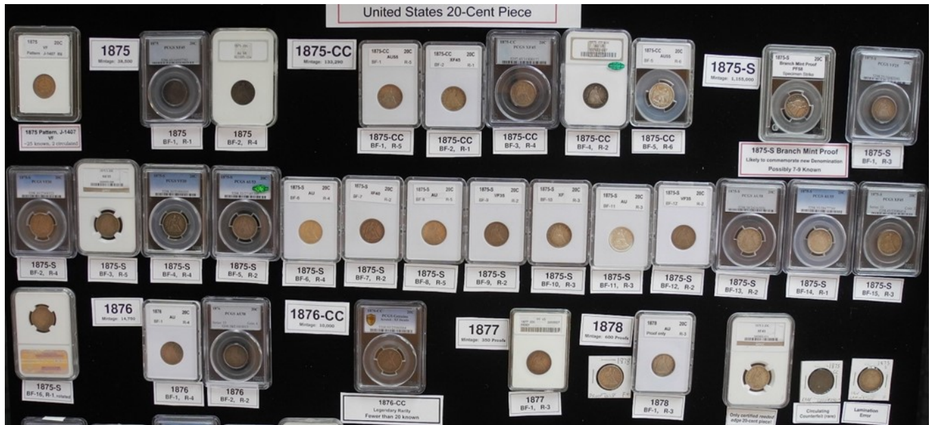
Complete die marriage set of double dimes