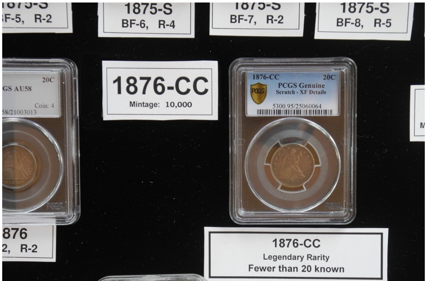
The E.A. Carson specimen of the 1876-CC twenty-cent piece, in case