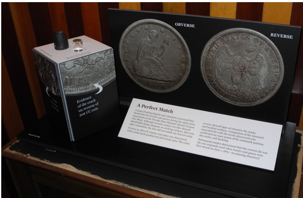
Exhibit with the 20-cent die, the coin (1875-CC BF-1), and enlarged photos