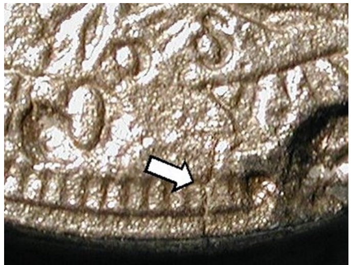
Perfect match of die crack and mintmark on coin and the die

Over the past months, I have been working with the History, Exhibits, and Education curators and directors to put together a new exhibit for the Nevada State Museum, featuring their die, and my coin struck by that very same die. We worked together on exhibit content, photos, and signage and on Friday August 21, we installed the exhibit, entitled A Perfect Match in the Mint building. It was an instant hit, with Museum visitors looking at the exhibit, the enlarged photos, and description, and saying things like “Neat!” and “Cool!” – many taking photos of their own.