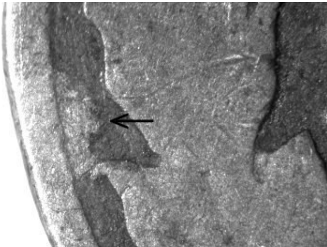
Extra surface metal at 9:00

An inspection of the obverse was then done to see what other anomalies could be located. The last A in AMERICA was too strong as compared to the rest of the letters but this alone would not confirm a counterfeit since many 1875-CC BW obverse dies have this characteristic (more on this point later in the article). I checked Liberty and the shield area. It was immediately noted that some of the shield lines were not straight rather having a bent or crooked appearance near the scroll. The image below is the best possible as the counterfeit has a dull surface and does not photograph easily.