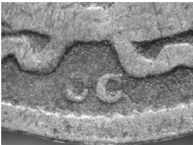
Weak or partial left C in mintmark

With all of the amassed evidence, it was finally concluded that this 1875-CC BW dime was a contemporary counterfeit and I felt comfortable listing it as such in the online contemporary counterfeit archives. What about the host coin for the transfer dies as this counterfeit had not signs of being cast? Upon reviewing my published 1875-CC Below Wreath research at www.seateddimevarieties.com , the probable host coin and die pairing was quickly located. The host dime for transfer die preparation is most likely the F-106 variety with a date punch that slopes down slightly. Checking the obverse image closely, one will note that the letters in AMERICA are not uniform in strength with the last A being the boldest. However, the non-uniformity of the AMERICA letters on the contemporary counterfeit is more pronounced than the host coin. It was the last A in AMERICA that triggered the first discovery of a